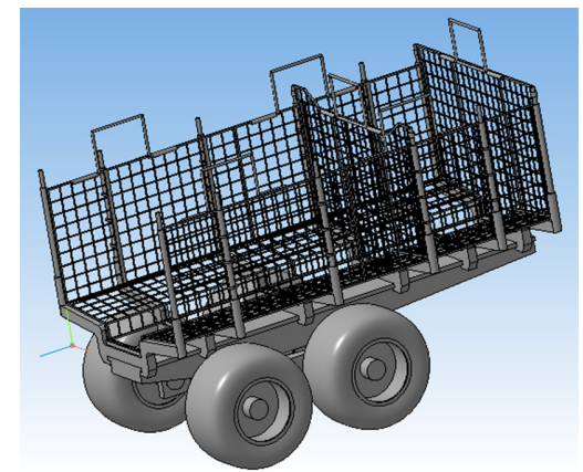
Figure 2: Removable body of sorting and transportation machine

For transportation of logging residues, the forwarder that is used for major works is equipped with a removable body that is fixed on the pillars of the cargo compartment. The transverse walls divide the body into compartments. The longitudinal, transverse sides are made of cellular metal to reduce the weight of the removable body, chipping of bark, needles and ash.